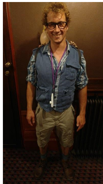
Thos in costume as Dad